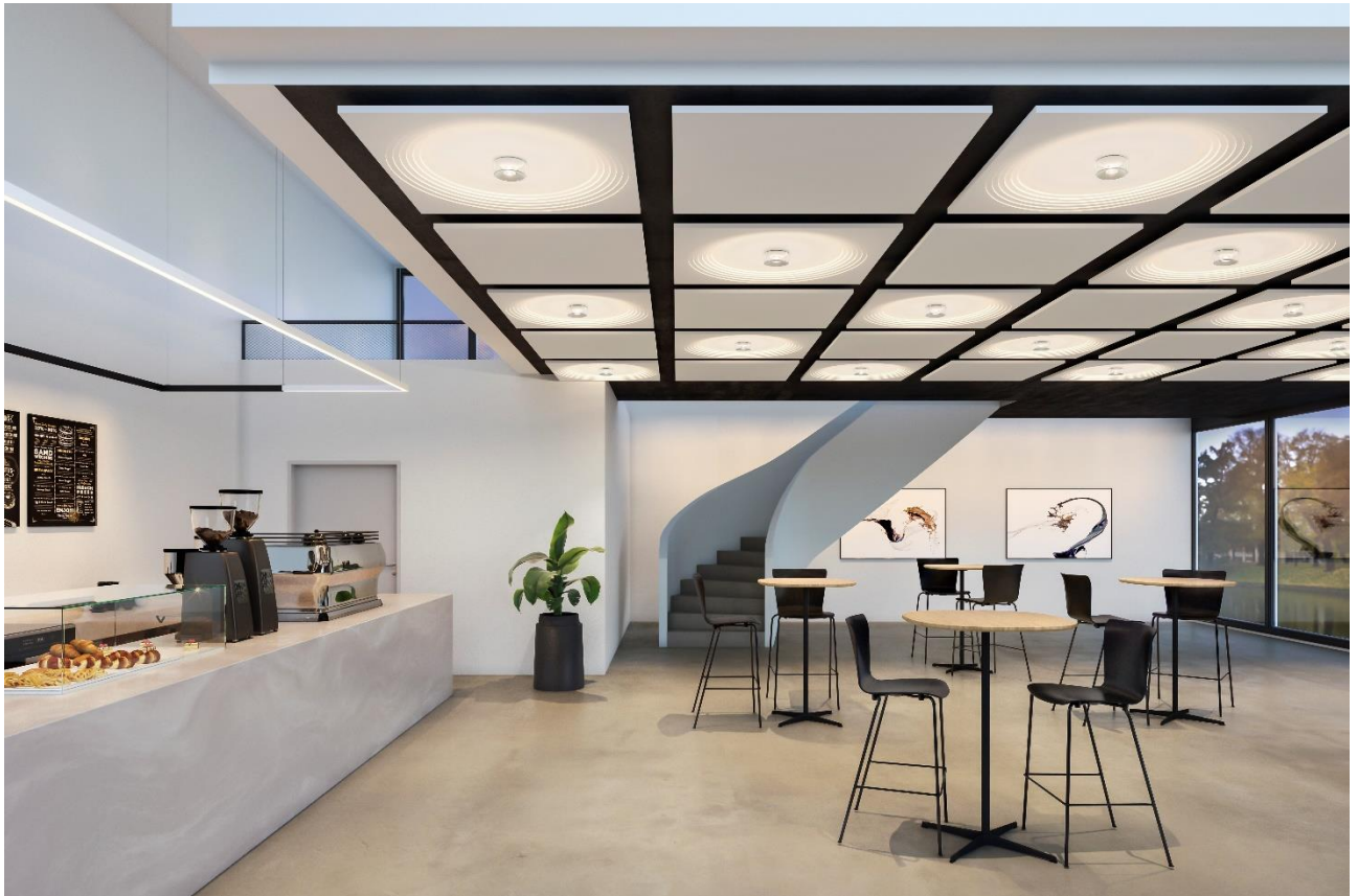
Fig2.: VIOR acoustic with square acoustic panels