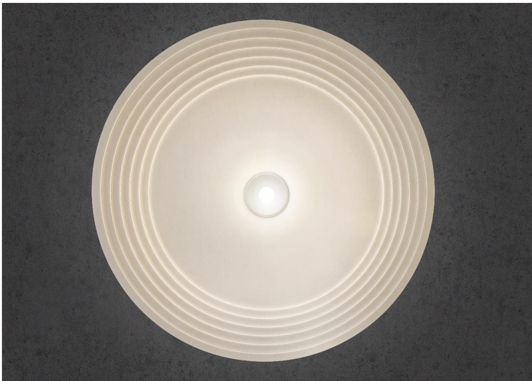
Fig3.: VIOR acoustic with round acoustic panel, bottom view