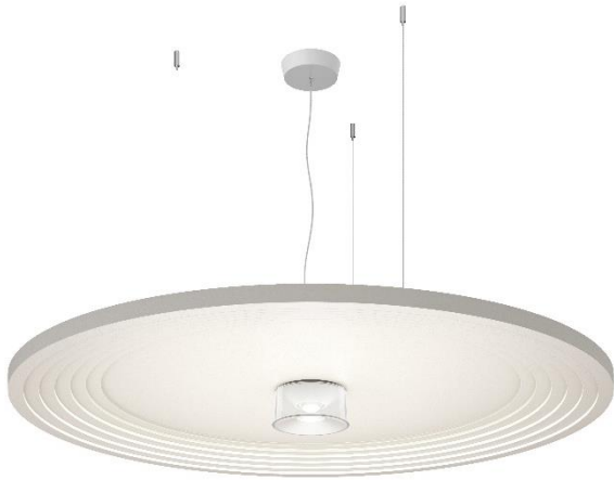
Fig.7: VIOR acoustic with round acoustic panel switched on, detailed view