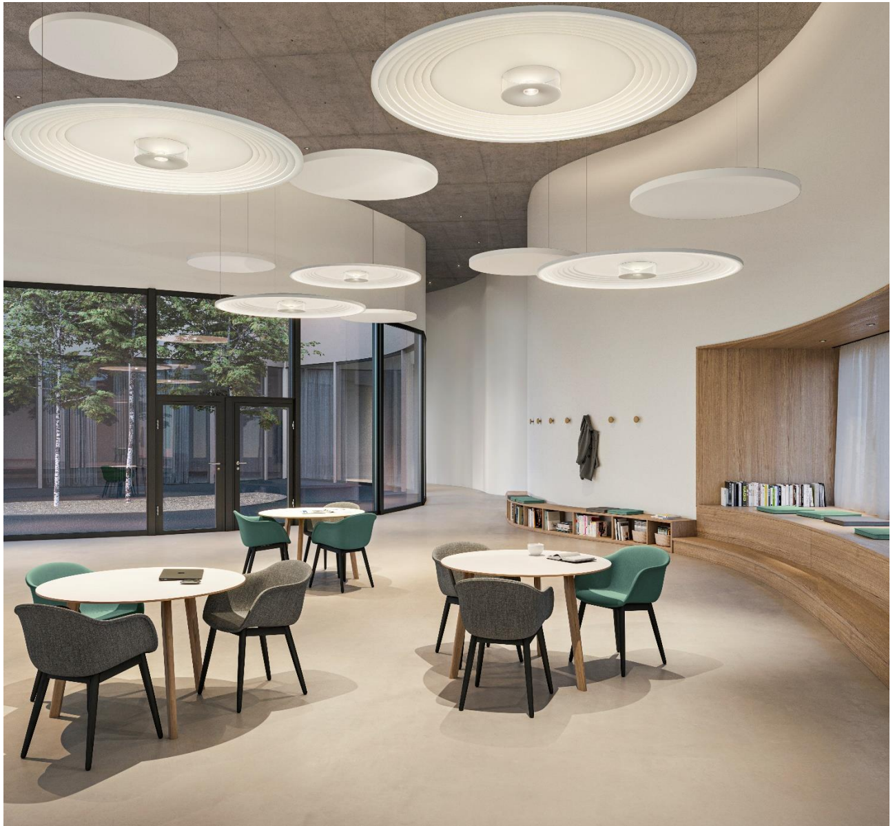
Fig1.: VIOR bold acoustic with round acoustic panels