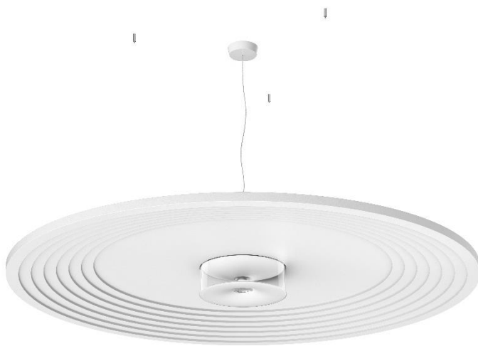
Fig4.: VIOR bold acoustic with round acoustic panel detailed view