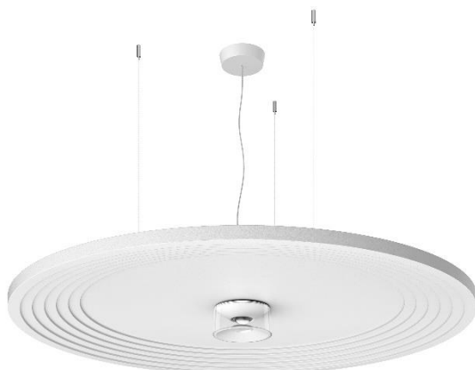
Fig6.: VIOR acoustic with round acoustic panel detailed view